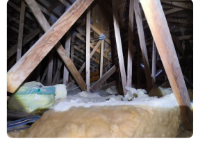
Item: Roof frame