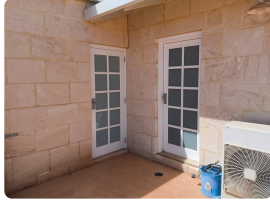
Item: Other external doors