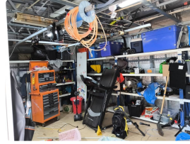
Item: Large shed